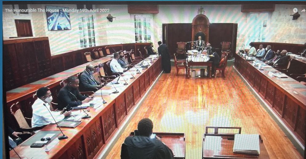
Picture of Hybrid Format