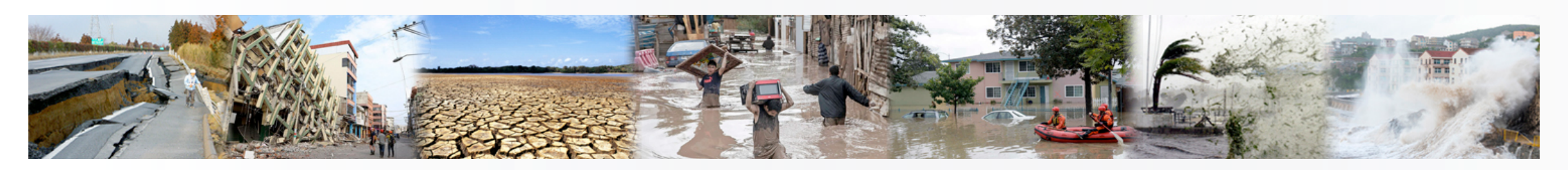
There is no such thing as "natural" disasters. There are only natural hazards.