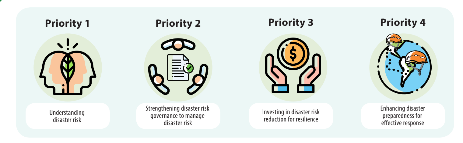
Figure 2: Icons linked to the priority actions of the Sendai Framework