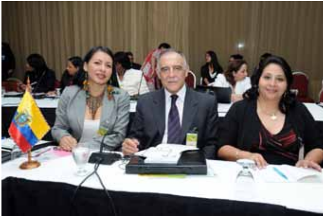
Parliamentarians of Ecuador