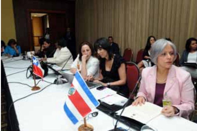
Parliamentarians working after the Round Table.

6. It is necessary to break the paradigm that actually rules the balance of power between men and women, by paying particular attention to those electoral systems that do not serve equality.