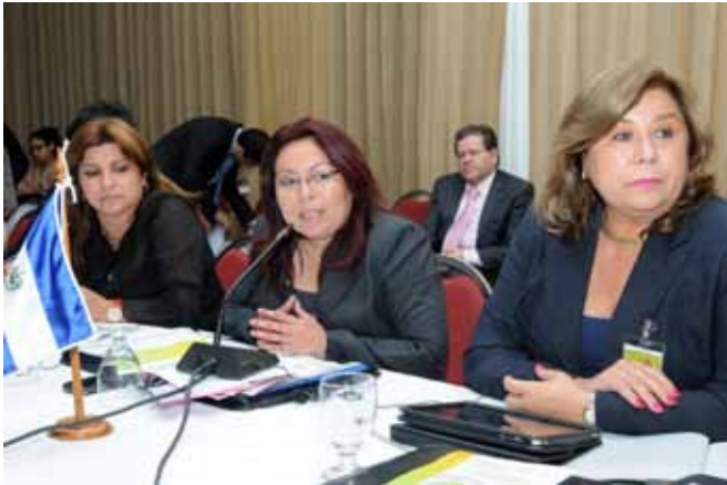
Participation of Parliamentarians during the debate.