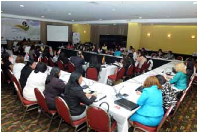
Panel 1: Leadership and Political Empowerment, second part.