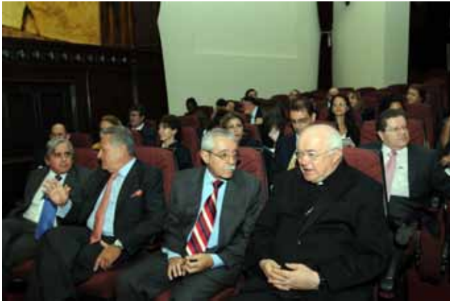
Opening Ceremony. Chamber of Deputies Plenary, Santo Domingo.