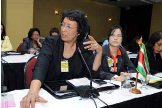
Participation of Suriname's representative during the debate.