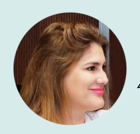
Member of the National Assembly CRISTINA REYES HIDALGO (Ecuador)

"As a Member of the National Assembly, this study visit allowed me to confirm the commitment that I have with my constituents to continue exercising my legislative and oversight role based on their demands and requirements, but above all to continue in the fight to achieve honest parliaments and institutions that instill legitimacy, credibility and trust in our nations."