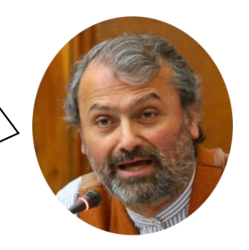
Member of the Chamber of Deputies PATRICIO VALLESPÍN (Chile)

"What can happen is that the Congress as an institution can have gaps that allow for transparency to not function adequately, for the lack of probity to manifest itself and for acts of unresolved potential conflicts of interests to be present. What we have done is fill these spaces through commitments with clear, measurable and timely objectives developed in collaboration with civil society organizations in Chile."