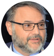
Member of Parliament Dan Ruimy (Canada), Vice-President of the ParlAmericas Parliamentary Network on Climate Change for North America

"Through [...] strategic partnerships, ParlAmericas is channeling the work that we do together through our Climate Change Network, to influence policymakers and lend support to the global effort to increase ambition to achieve the goals of the Paris Agreement."