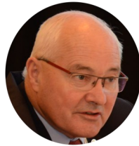
The Hon. Wayne Easter (Canada), Member of Parliament and Chair of the Standing Committee on Finance

"It is important to identify themes that truly matter to people, businesses and communities so that they can engage around that topic to bring focus to the committee meetings, and to select themes that allow both individuals and organizations to identify with it."