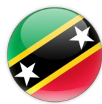
SAINT KITTS & NEVIS