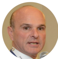
Member of Parliament Randy Boissonnault (Canada), Vice-President of the ParlAmericas Open Parliament Network for North America

Interested in this topic? Watch the full video of this session on our ParlAmericas YouTube Channel .