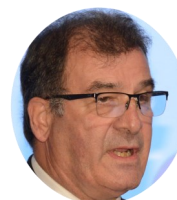
Member of Parliament the Hon. Robert Nault (Canada), President of ParlAmericas

"I believe that there is no doubt that a strong democracy is key to our future prosperity – key to protecting our freedoms, and key to our collective security. I also believe that democracy is – by far – the best form of government in the world today, and in my view, it will continue to thrive and expand. And while there will always be challenges, we as parliamentarians play an integral role in preserving and protecting our democratic values – now and into the future. "