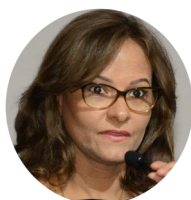
The Hon. Elizabeth Cabezas (Ecuador), President of the National Assembly and Vice-President of ParlAmericas

"We feel very honoured to be a part of ParlAmericas, as the issues undertaken are topical and of importance to many of our countries. These are topics that we hold in common but also require our dedicated work."