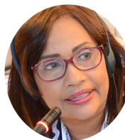
Member of the Chamber of Deputies Ángela Pozo (Dominican Republic)

"The most important part of the budget proposal is citizen participation. The entire budget of the State of Ecuador is based on this participation which takes place in the first phase of development and continues in the National Assembly. It not only takes place in the formulation of public policies but it also extends to the whole cycle guarantee that input is provided by each of the various communities, social organizations and peoples. "