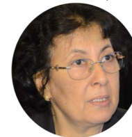
The Hon. Jennifer Simons (Suriname), President of the National Assembly and Vice-President of the ParlAmericas Parliamentary Network on Climate Change

"What we can do as parliaments and governments to make sure that climate-induced migrants and refugees are able to receive protection and services is to start a campaign to get them recognized internationally. Nationally, these protections can only be achieved by including climate migrants in climate legislation and disaster programs. Regionally, we can strengthen and improve existing mechanisms like Caribbean Disaster Emergency Management Agency (CDEMA) so that they can coordinate actions to ensure that climate refugees are assisted in a safe and timely manner, and where necessary create new mechanisms for concrete and immediate disasters in the region."