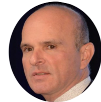
Member of Parliament Randy Boissonnault (Canada), Vice-President of the ParlAmericas Open Parliament Network for North America

"Parliamentarians through their unique roles can contribute to the progress and sustainability of open government initiatives in their respective countries, and promote these same [openness] principles in their own parliaments through actions and initiatives that strengthen the engagement of civil society and public participation [in legislative work], as we have been fostering through the Open Parliament Network."