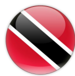
TRINIDAD & TOBAGO