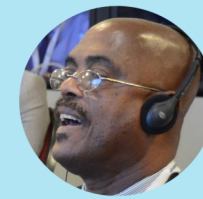
The Hon. Chester Humphrey (Grenada), President of the Senate and Vice-President of the Parliamentary Network for Gender Equality for the Caribbean

"Indigenous women in our societies have two layers of exploitation: first the national oppression by virtue of being a nation within a nation and facing discrimination, and then anthropologically within the culture, the dominance of the male. It is a similar experience that Africans would have had in a society where racism was a dominant feature of the ideological superstructure that existed then... There might be opportunities to leverage the connection between the people of African descent in Nicaragua and the people of the Anglophone Caribbean to exchange experiences and learn from each other."