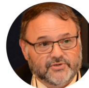
Member of Parliament Dan Ruimy (Canada), Vice-President of the ParlAmericas Parliamentary Network on Climate Change for North America

"Budgets are very complicated and most people only hear snippets through the media and don't have the time to analyze the information and fully understand it, so what I try to do is refer information back to my riding [...] I went through the budget and took out ten items that I thought connected with my riding and then I made ten one minute videos on each specific one and I posted it on social media [...] it was well received and my constituents understood how the budget would impact them."