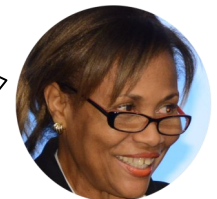
The Hon. Jeannine Giraudy-McIntyre (Saint Lucia), President of the Senate

"Parliaments and governments can promote human rights and access to social protection for women domestic workers through their ministries of labour and gender affairs, who can encourage awareness campaigns, educate domestic workers on their rights and promote legislation in accordance with the established treaties that the countries have signed on to, particularly the Skill-Free Movement in the CARICOM Single Market and Economy (CSME) which includes domestic workers."