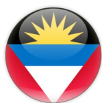
ANTIGUA & BARBUDA