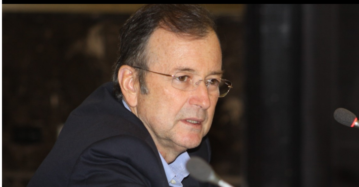
Ottón Solís Fallas