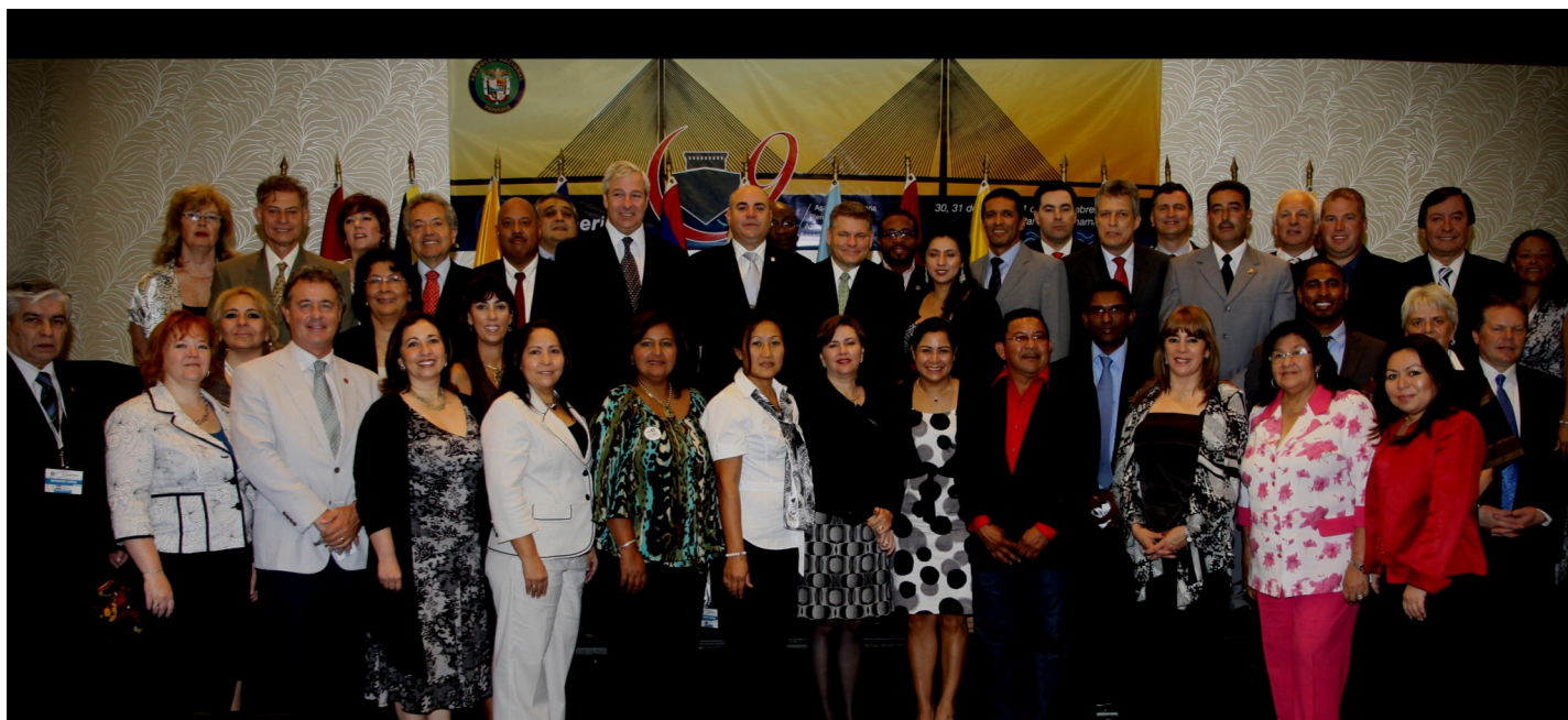
Official photo of the 9 th Plenary Assembly of ParlAmericas

The 9 th Plenary Assembly of ParlAmericas was held between 30 August and 1 September 2012 in Panama City, Panama, and covered four main topics: Weak Rule of Law, a threat to Citizen Security, The Impact of the Global Economic Crisis on the Americas, Climate Change and the Environment, and Financial Crisis and its Effects on Women in the Region.