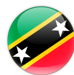
SAINT KITTS AND NEVIS