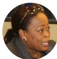
Senator DIEUDONNE LUMA ÉTIENNE (Haiti)

“Developing countries require greater support concerning availability of financial resources for climate-related issues. In the case of Haiti, marginalized communities use deforestation as a means to produce charcoal, a lucrative local commodity. Haitian women are highly vulnerable, as the profits from selling this good are needed to nourish their children. Women are faced with the having to choose between the survival of their children, and engaging in more sustainable and environmentally cleaner practices. There is a need for strategic development in smaller countries to address these challenges. Initiatives pertaining to technical training as well as access to financing could certainly benefit communities facing such dilemmas.”