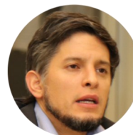
GIAN CARLO DELGADO , Member of the Working Group II, IPCC - Cities

“Legislative efforts [are necessary] at a national scale to explore the communication gaps within the three levels of government, to ground legislative actions and enable concrete actions that transform the urban space at a local scale because we're a highly vulnerable region.”