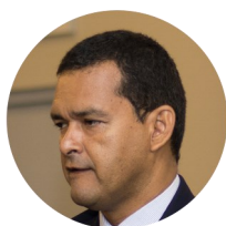
RAÚL SALAZAR , Chief of the United Nations Office for Disaster Risk Reduction (UNISDR) Secretariat for the Americas

“Given the growing scale of [climate related] losses, disaster risk management should be high on the political agenda. But few governments give the same priority to disaster risk reduction (DRR) as in dealing with unemployment or fiscal stability. The HFA progress review shows that few countries are able to quantify their investments in DRR. It is clear that the strategy we have been pursuing up to now of addressing risk through stand-alone DRR projects is only nibbling at the edges of the problem.”