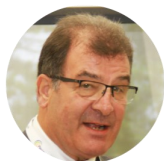
Member of Parliament the Hon. ROBERT NAULT (Canada), President of ParlAmericas

"Climate change impacts are not gender neutral and they can affect populations and individuals differently. There are underlying societal factors that drive individuals to be more exposed and vulnerable to climate effects. There is a need to understand the needs of these individuals and to consult them in the process of developing legislation, determine budget allocations and implement political oversight that addresses climate change and disaster risk."