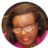
Deputy President of the Senate, Hon. MAURICIA THOMAS-FRANCIS (Saint Lucia)

“Each country should be involved and have a tangible say in formulating carbon pricing and the formula such as arriving at an equitable and fair mechanism for calculating the pricing appropriately. I gathered that for our region we have not arrived at a formula for pricing, I believe there must be some kind of equitable way in arriving at that, so small islands do not continue to suffer on these kinds of regimes. We need to ensure that it is done appropriately because every little bit of cost, for a small country with a fragile economy creates economic social dislocation and by extension social dislocation and our small islands just cannot afford any more of that.”