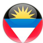
ANTIGUA AND BARBUDA