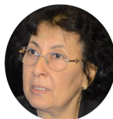
The Hon. JENNIFER SIMONS (Suriname), President of the National Assembly and Vice-President of the Parliamentary Network on Climate Change

“Robust oversight mechanisms and counting systems that are necessary for carbon pricing to work on a national level or in cooperation with international partners have to be established and parliaments will definitely have a role in the process”