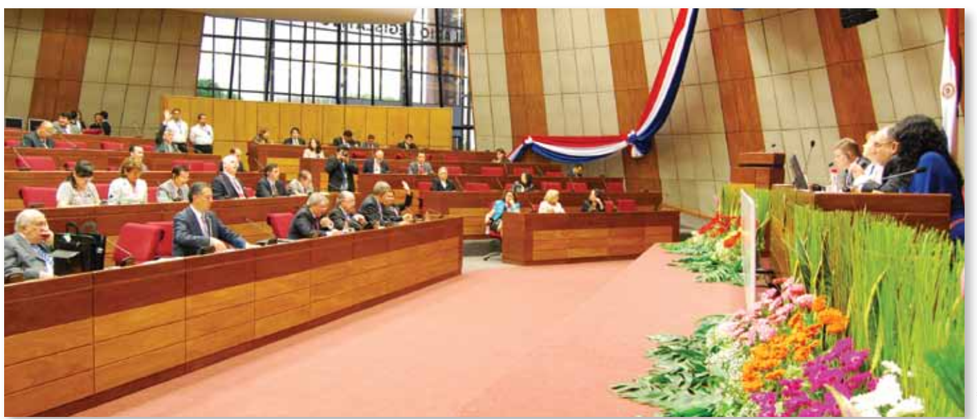
First Session of the Plenary Assembly