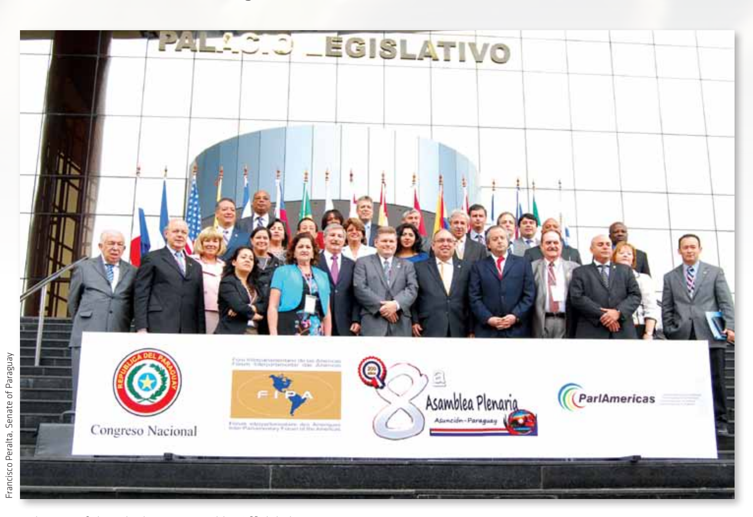
Delegates of the 8th Plenary Assembly–Official Photo

We would also like to express our sincere thanks to the guest speakers and working group secretaries for their invaluable contribution to the working sessions.