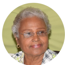
Her Excellency Dame Billie Miller , Ambassador Extraordinaire and Plenipotentiary of Barbados and Patron of CIWiL

“In every region there are always women who defy the hurdles and the odds. The more women get elected to parliament, the more women will get elected to parliament. Every woman who is elected raises the consciousness and confidence of other women... Women are a high return investment which yields great dividends.”