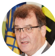
The Honourable Robert Nault , Member of Parliament (Canada) and President of ParlAmericas

“It is very clear to me and others that in order to be successful, men and women must work together to build the inclusive societies that we strive for. We need to defend the equal rights of women as human rights – the inequality of women and girls hurts all of us, men and boys included.”