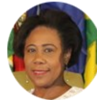
The Honourable Bridgid Annisette-George (Trinidad and Tobago), Speaker of the House of Representatives, member of the ParlAmericas Board of Directors, and host of the Gathering

"The engagement and leadership of both men and women, equally, are needed to make our response to climate change fully effective. One size does not fit all; gender neutrality – even if there were in reality such a thing – in the context of climate change and sustainable development will not only be inappropriate but is, and shall be, ineffective, inefficient and result in a wastage of resources. And of course, it shall leave, if not half, very large segments of our populations behind. We as legislators have long recognized that gender is a cross-cutting theme, and therefore it is incumbent upon us in this discharge of our responsibilities to fashion accordingly our policies of mitigation and risk reduction, preparation response and rehabilitation, and resilience and adaptation."