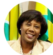
Member of Parliament BRIDGID ANNISETTE-GEORGE (Trinidad and Tobago), Speaker of the House of Representatives and ParlAmericas Board Member

Member of Parliament Bridgid Annisette-George (Trinidad and Tobago), Speaker of the House of Representatives and ParlAmericas Board Member, opened the event alongside Senator Dr. Saphire Longmore (Jamaica), Vice-President of the ParlAmericas Open Parliament Network for the Caribbean.